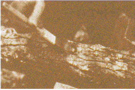
Figure 5. Holes filled with spawn are sealed with hot wax.

applied to the filled holes with special wax applicators, which look like kitchen turkey basters, or with a brush (Figure 5). Be sure to use a natural hair brush because most synthetic brushes will melt in the hot wax.