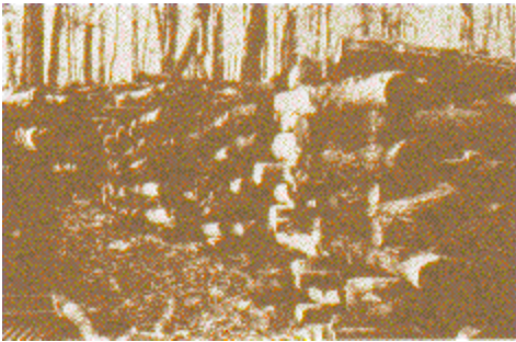
Figure 6. Crib stacking system.

There are many log stacking systems. The system you choose should depend on your preference and the spawn run site. Two common systems are crib stacks and lean-to stacks. Crib stacks are built of horizontal layers of logs laid perpendicular to each other (Figure 6). Each layer contains four to eight logs in stacks about 4 feet high. Although these stacks use space efficiently, are self-supporting, and allow for good air movement, there is a pronounced difference in temperature and humidity between the top and bottom layers of the stack. Lean-to stacks are composed of vertical rows of logs supported against a horizontal rail or wire (Figure 7). They do not require lifting logs to various heights, as with the crib stack system, and picking is easier, but they require a large amount of space and there are differences in temperature and humidity between the two ends of the logs.