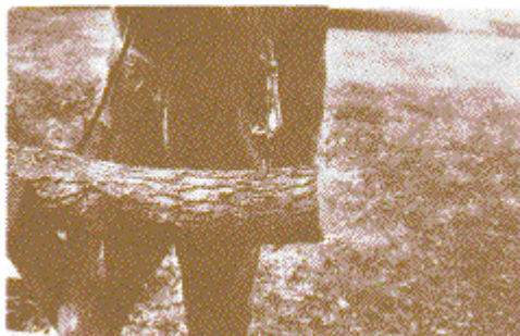
Figure 2. Holes are drilled in the log with a high-speed drill.

Sawdust or dowels are placed in holes drilled into the logs (Figure 2). Spawn suppliers provide information on the hole depth and diameter. Holes should be spaced 6 to 8 inches apart in rows along the length of the log with 2 to 4 inches between rows. The holes should be staggered in a diamond pattern to ensure rapid growth of the fungus throughout the log (Figure 3). Closer spacings increase the rate of colonization and result in more rapid mushroom production. Spawn costs, however, are also greater.