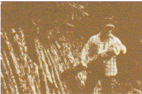
Figure 7. Lean-to stacking system.