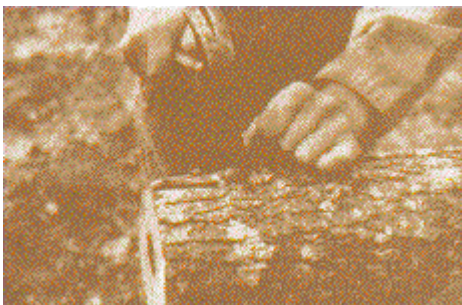
Figure 4. Dowels are pounded into the holes with a hammer.

Spawn should be placed in the holes immediately after they have been drilled to prevent contamination by other fungi (Figure 4). Immediately after the spawn has been inserted, seal the holes with hot wax or foam plugs to prevent the spawn from drying.