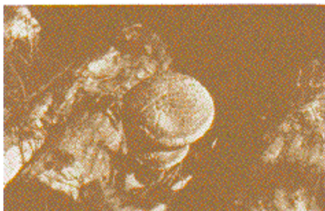
Figure 9. Mushrooms ready for harvest.

Daily harvesting is required during fruiting periods (Figure 9). Mushrooms should be picked while there is still a small curl at the edge of the cap, usually five to seven days after the mushroom first appears. Mushrooms should be cut or twisted off at the base of the stem. They should be gently placed into smooth-sided, clean, vented containers. Do not stack the mushrooms more than 6 inches high to prevent bruising. Cool the mushrooms as soon after harvest as possible to a temperature between 32° and 36°F and maintain the relative humidity at about 85 percent. Under these conditions, the mushrooms will store well for at least two weeks. They can also be dried very successfully. The simplest way is to place them in a forced-air drier at about 120°F.