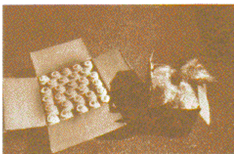
Figure 1. Shiitake spawn is available in sawdust (left) or on wooden dowels (right).

The shiitake fungus is introduced into logs by inserting the mycelium in the form of spawn , a process known as inoculation . A listing of current spawn suppliers is available from your county Cooperative Extension Center. Spawn is available in two forms: sawdust and dowels (Figure 1). These materials are inoculated with the shiitake fungus by the supplier and are ready to use upon receipt. Both materials are covered with a fuzzy, white growth (mycelium) similar in texture to bread mold. The spawn can be stored in a refrigerator or cold room for several months but should be held at room temperature for several days before inoculation. Sawdust spawn is usually sold in bags or bottles. Dowels are usually sold in bags of 1,000. Results from some studies suggest that sawdust spawn produces mushrooms faster than dowels and is generally less expensive. Many new producers, however, find that dowels are easier to use and have a higher rate of success because moisture control is not quite as critical.