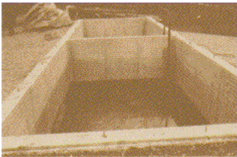
Figure 8. Structure for soaking logs.

If the logs are left alone, seasonal changes in temperature and moisture will cause fruiting to occur naturally. For a steady supply of mushrooms, however, it is necessary to control fruiting time. This control can be achieved by carefully selecting shiitake strains, by soaking or sprinkle-irrigating the logs at specific times, and by using some type of structure to provide some control of temperature. Many growers restack the logs before fruiting occurs to provide more space for the mushrooms to grow and to facilitate harvesting. If rain is not in the forecast when fruiting is desired, the logs can be irrigated or soaked in water (Figure 8) for 24 to 48 hours to induce fruiting. As the logs dry, pinning , the appearance of mushroom primordia, occurs. Excessive moisture will lower mushroom quality; low humidity and drying winds will stop the mushrooms from growing. Protect the logs by covering the stacks loosely with plastic tarps or humidity blankets or by building simple rigid structures over the stacks. Mushrooms will usually appear within a week of soaking.