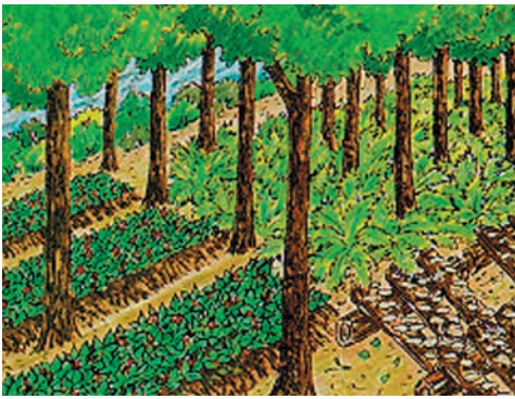
In this forest farming practice, shiitake and other forest farming products, such as ferns and ginseng, are grown under the shade of trees.

understory of a forest are often termed non-timber forest products. However, to accomplish this, forest canopy densities must be controlled.