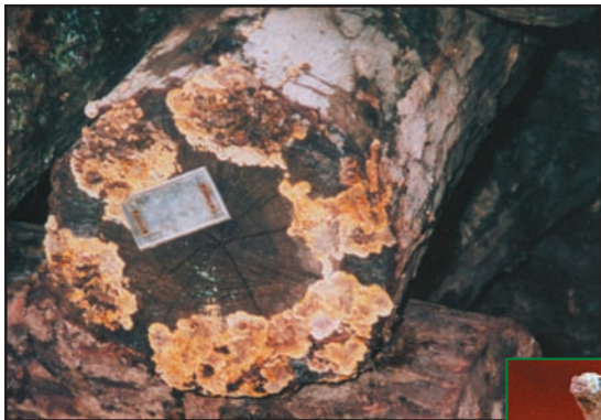
Above: Stereum (a contaminating wood decay fungus) fruiting on log end between rows of inoculation sites. Inset: Snail feeding on shiitake cap.

Correspondingly, as shiitake mushroom production begins to decline after several years, logs become a liability due to the build-up of contaminating fungi. Smaller logs are generally consumed more rapidly than larger. Logs that produce abundant fruiting bodies of competing fungi should be removed from the commercial production area, because fruit bodies of contaminant fungi are producing spores that increase their presence in the production area.