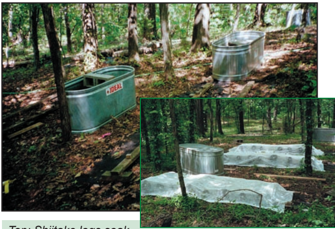
Top: Shiitake logs soak overnight in a stock-watering tank equipped with a drain. Inset: At this point, developing mushrooms may be protected from both desiccation and heavy rain by covering logs during fruiting with horticultural fabric (see below).

temperature fluctuations in spring and autumn, but are unresponsive to soaking. For this reason, growers often prefer to inoculate their largest logs with cool weather strains because they do not need to be moved to a tank for soaking and can be left to fruit naturally in response to changing temperature.