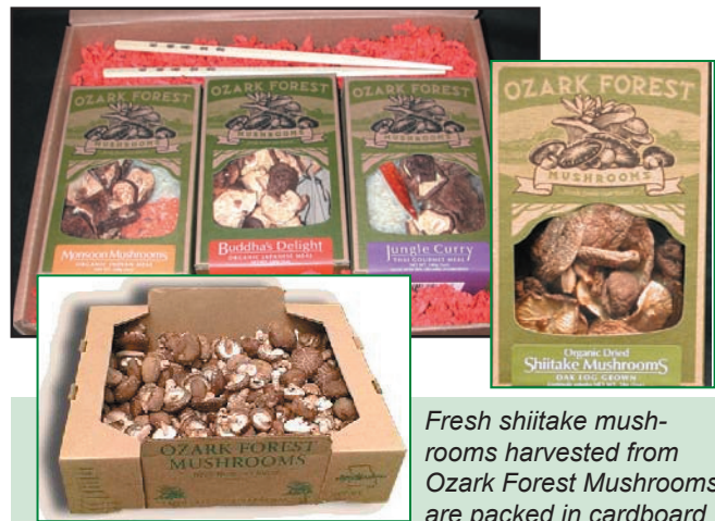
Fresh shiitake mushrooms harvested from Ozark Forest Mushrooms are packed in cardboard containers for delivery to chefs and restaurants, left inset. Top and right inset: Value-added dried mushroom mixes are paired with locally grown rice for an attractive and consumer-friendly retail product.

Markets for shiitake and other specialty gourmet mushrooms continue to show promising profit potential for Missouri forest land owners. Interest in fresh locally grown shiitake mushrooms is increasing with gourmet chefs, farmers' markets and household consumers, as information spreads about their nutritional benefits and rich, versatile taste.