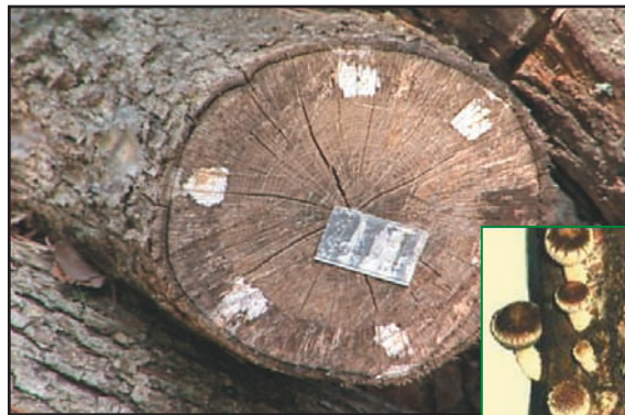
Above: The mycelium is often visible at the ends of logs after spawn run. The rows of inoculation holes were spaced too far apart in the log above to effect complete colonization. As a result, undesirable colonization by competing decay fungi may result. (See box page 5.) Inset: Inoculated and fully colonized logs at the fruiting stage.

Mushrooms are often called fruiting bodies because they are the site of spore production by the fungus. The mushroom stem serves to elevate the mushroom cap into the air; the cap serves to protect the developing gills; and the gills provide an extensive surface on which myriad spores are produced. Mushroom spores are sexual propagules of the fungus species, and therefore are highly variable. This is why we do not use spores as inoculum to cultivate shiitake. The mycelium and mushrooms produced from spores would likely differ from the parent strain in various important characteristics.