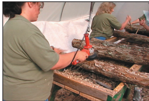
Holes are drilled in cut logs using an extremely high-speed drill.

Spawn is sold in plastic bags that contain 5 to 10 pounds of colonized amended sawdust. Bags have a breathing patch of mesh fabric that permits gas exchange and prevents fungus suffocation without permitting contamination. Each block of spawn consists of brownish sawdust bound together by white mycelium, all covered with a white mycelial felt with brown patches. Mushrooms may even form inside the bag and should be discarded or eaten. Spawn should be ordered several months in advance of need, to allow for production time. The supplier should try to ship the spawn to arrive just prior to planned inoculation.