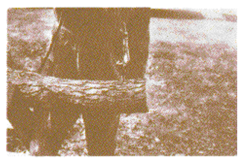
Figure 2. Holes are drilled in the log with a high-speed drill.

Sawdust or dowels are placed in holes drilled into the logs (Figure 2). Spawn suppliers provide information on the hole depth and diameter. Holes should be spaced 6 to 8 inches apart in rows along the length of the log with 2 to 4 inches between rows. The holes should be staggered in a diamond pattern to ensure rapid growth of the fungus throughout the log (Figure 3). Closer spacings increase the rate of colonization and result in more rapid mushroom production. Spawn costs, however, are also greater.