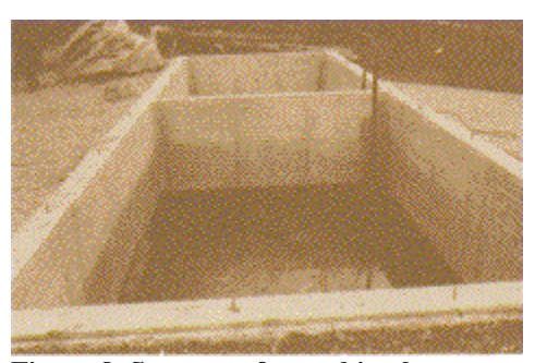
Figure 8. Structure for soaking logs.

If the logs are left alone, seasonal changes in temperature and moisture will cause fruiting to occur naturally. For a steady supply of mushrooms, however, it is necessary to control fruiting time. This control can be achieved by carefully selecting shiitake strains, by soaking or sprinkle-irrigating the logs at specific times, and by using some type of structure to provide some control of temperature. Many growers restack the logs before fruiting occurs to provide more space for the mushrooms to grow and to facilitate harvesting. If rain is not in the forecast when fruiting is desired, the logs can be irrigated or soaked in water (Figure 8) for 24 to 48 hours to induce fruiting. As the logs dry, pinning , the appearance of mushroom primordia, occurs. Excessive moisture will lower mushroom quality; low humidity and drying winds will stop the mushrooms from growing. Protect the logs by covering the stacks loosely with plastic tarps or humidity blankets or by building simple rigid structures over the stacks. Mushrooms will usually appear within a week of soaking.