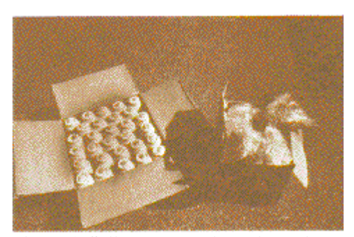
Figure 1. Shiitake spawn is available in sawdust (left) or on wooden dowels (right).

The shiitake fungus is introduced into logs by inserting the mycelium in the form of spawn , a process known as inoculation . A listing of current spawn suppliers is available from your county Cooperative Extension Center. Spawn is available in two forms: sawdust and dowels (Figure 1). These materials are inoculated with the shiitake fungus by the supplier and are ready to use upon receipt. Both materials are covered with a fuzzy, white growth (mycelium) similar in texture to bread mold. The spawn can be stored in a refrigerator or cold room for several months but should be held at room temperature for several days before inoculation. Sawdust spawn is usually sold in bags or bottles. Dowels are usually sold in bags of 1,000. Results from some studies suggest that sawdust spawn produces mushrooms faster than dowels and is generally less expensive. Many new producers, however, find that dowels are easier to use and have a higher rate of success because moisture control is not quite as critical.