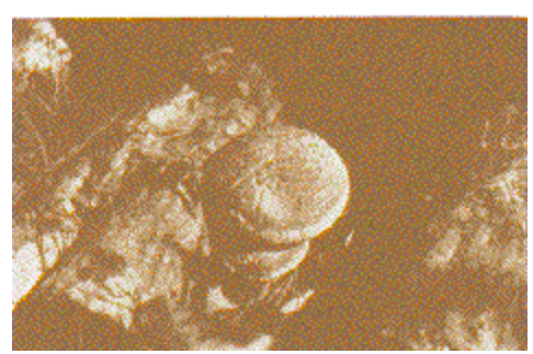
Figure 9. Mushrooms ready for harvest.

Daily harvesting is required during fruiting periods (Figure 9). Mushrooms should be picked while there is still a small curl at the edge of the cap, usually five to seven days after the mushroom first appears. Mushrooms should be cut or twisted off at the base of the stem. They should be gently placed into smooth-sided, clean, vented containers. Do not stack the mushrooms more than 6 inches high to prevent bruising. Cool the mushrooms as soon after harvest as possible to a temperature between 32° and 36°F and maintain the relative humidity at about 85 percent. Under these conditions, the mushrooms will store well for at least two weeks. They can also be dried very successfully. The simplest way is to place them in a forced-air drier at about 120°F.