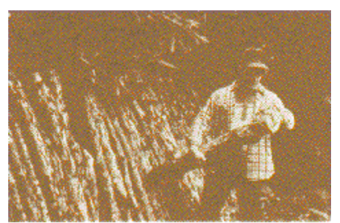
Figure 7. Lean-to stacking system.