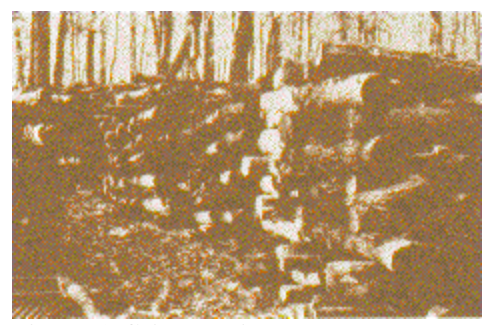
Figure 6. Crib stacking system.

There are many log stacking systems. The system you choose should depend on your preference and the spawn run site. Two common systems are crib stacks and lean-to stacks. Crib stacks are built of horizontal layers of logs laid perpendicular to each other (Figure 6). Each layer contains four to eight logs in stacks about 4 feet high. Although these stacks use space efficiently, are self-supporting, and allow for good air movement, there is a pronounced difference in temperature and humidity between the top and bottom layers of the stack. Lean-to stacks are composed of vertical rows of logs supported against a horizontal rail or wire (Figure 7). They do not require lifting logs to various heights, as with the crib stack system, and picking is easier, but they require a large amount of space and there are differences in temperature and humidity between the two ends of the logs.