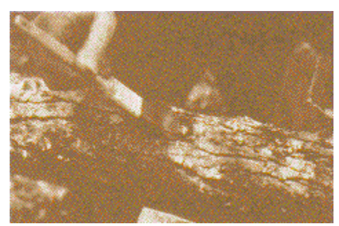
Figure 5. Holes filled with spawn are sealed with hot wax.

applied to the filled holes with special wax applicators, which look like kitchen turkey basters, or with a brush (Figure 5). Be sure to use a natural hair brush because most synthetic brushes will melt in the hot wax.